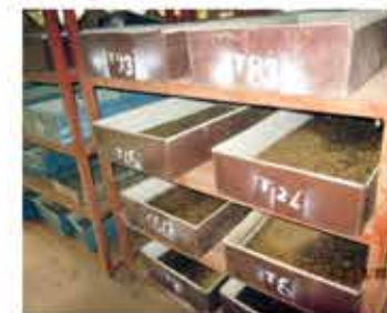
Plate 7: BSF larvae being grown in larger troughs on substrate

Transfer the content of 3 incubation bowls into 7kg substrate in larger bowls or troughs (Plate 7). Allow the larvae to feed on the substrate for 8-10 more days. At this stage