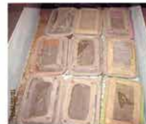
Plate 5: Incubation boxes with eggs ready for storage

Cover the incubation bowls with net and store securely at room temperature for about five (5) days to allow eggs to hatch (Plate 5).