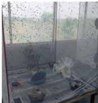
Plate 1: Adult rearing of BSF to obtained eggs

Raise adult black soldier flies in love cages (as seen in Plate 1) to mate and lay eggs.