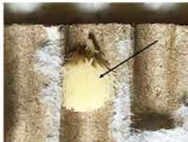
Plate 3: BSF egg mass (arrowed) exposed by removing top layer of cardboard

Exposed eggs mass from cardboard holes to harvest (as in Plate 3).