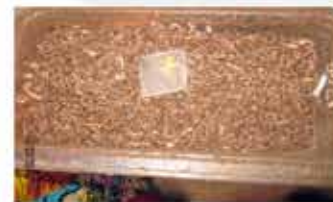
Plate 4: Eggs placed on substrate (e.g. brewery waste as in this picture) in bowls

Harvest the eggs with the help of clean stick onto substrate. Place about 0.15g of eggs on paper and place on 200g substrate (eg wheat bran, brewers spent grain, animal dropping, fruit waste etc.) in incubation bowls (Plate 4).